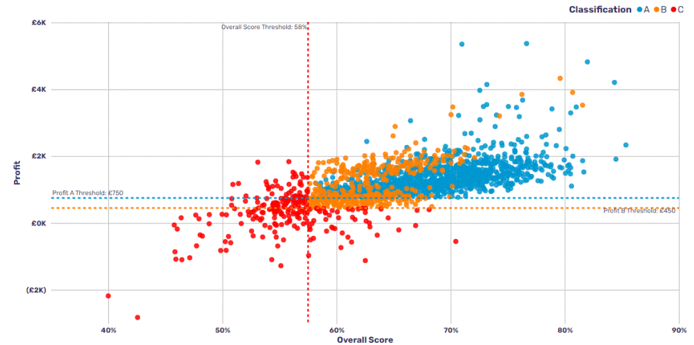
Graph showing the NPH asset performance distribution